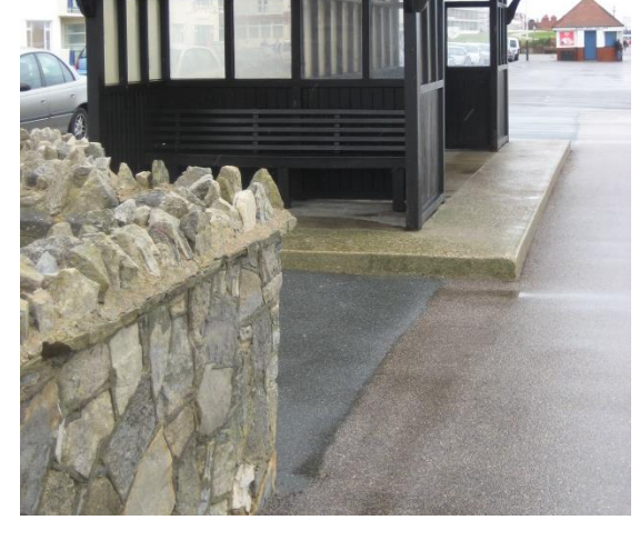
Top – before