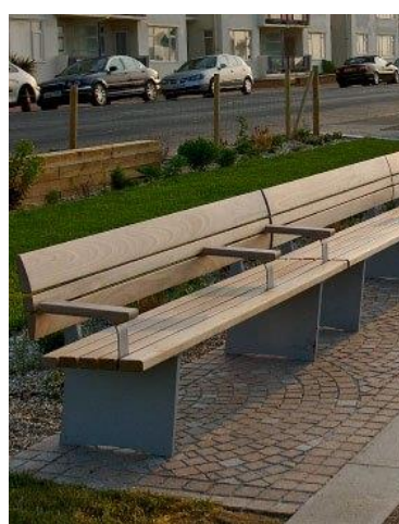
Consultation Draft - Rother District Council: Public Realm Strategic Framework