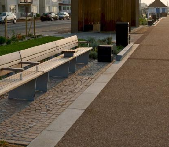
Consultation Draft - Rother District Council: Public Realm Strategic Framework