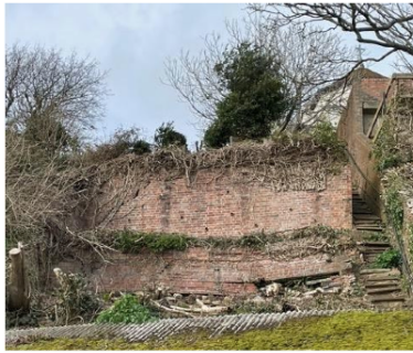
Stability of the wall is likely to be a public liability issue for the householder as if it collapsed it would not seem to fall into the road.

All the works are within the Conservation Area and are under the article 4 directive. Therefore works to trees and fences require consent. South Undercliff is a trunk road and is under the control of Highways England. There does not appear to be sufficient turning space off the road and the sight lines do not appear adequate.