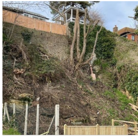
Tree has been lopped. As it is in conservation area this require an application.