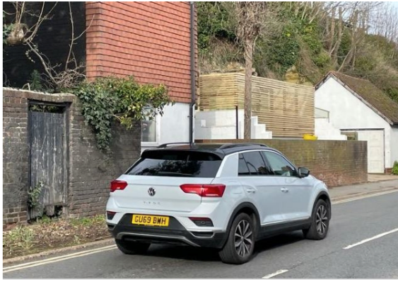
New fence within conservation area which is covered by article 4 directive and should require an application.